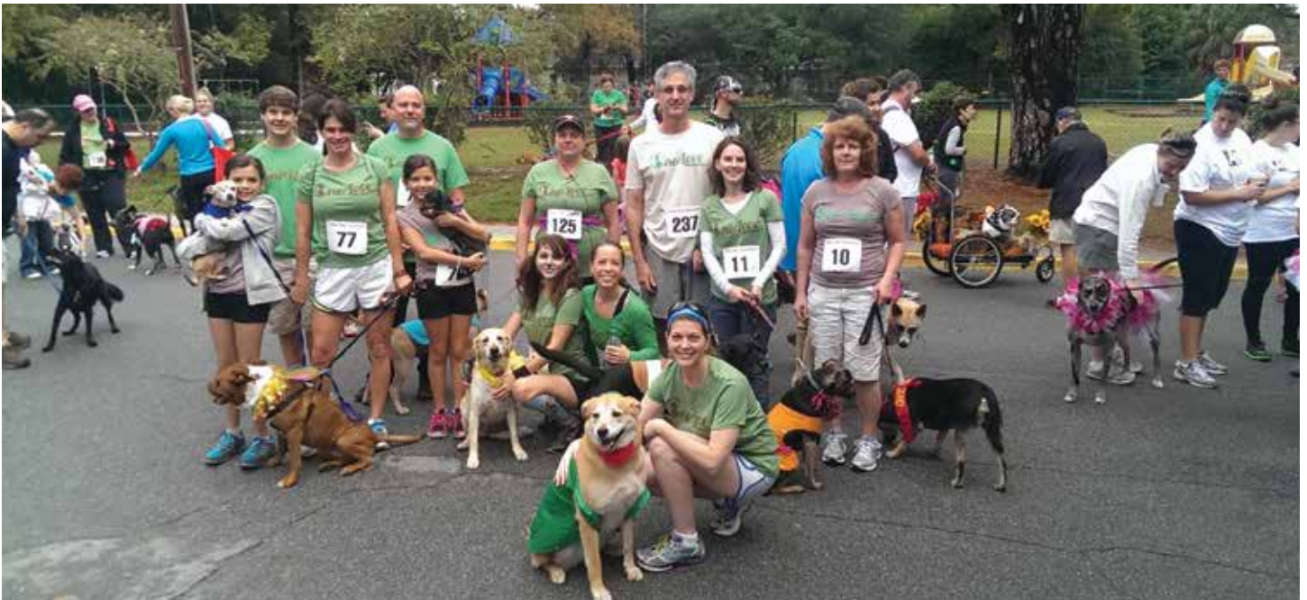
One Love Animal Rescue volunteers, foster families and their charges gathered for the annual Woof Woof Run fundraiser.